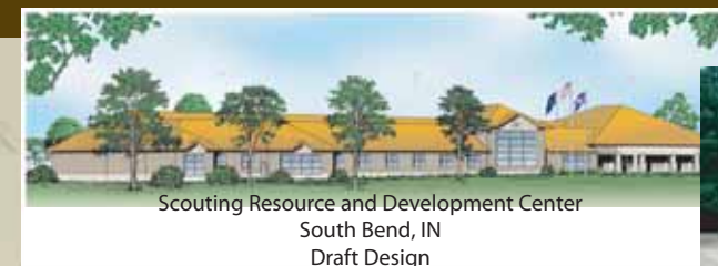
Scouting Resource and Development Center South Bend, IN Draft Design