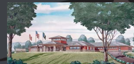
Conceptual Drawing of Scouting Development and Resource Center

In the past year, over 90 community volunteers have joined this effort resulting in more than $1,000,000 raised toward our goal. The Shower House at Camp Tamarack, Wood Lake Scout Reservation is one of the first successes within this campaign. Plans to transform recently burnt down Dining Hall at Camp ToPeNeBee into a state-of-the-art training facility are also a key project of this campaign. The campaign is also focusing on expanding the Council's funds for at-risk youth and endowment.