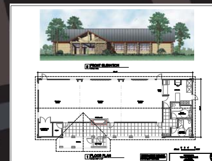
Training Center at Camp ToPeNeBee

In the past year, over 90 community volunteers have joined this effort resulting in more than $1,000,000 raised toward our goal. The Shower House at Camp Tamarack, Wood Lake Scout Reservation is one of the first successes within this campaign. Plans to transform recently burnt down Dining Hall at Camp ToPeNeBee into a state-of-the-art training facility are also a key project of this campaign. The campaign is also focusing on expanding the Council's funds for at-risk youth and endowment.