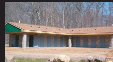
Shower House at Camp Tamarack

In 2003, the LaSalle Council kicked off its first capital campaign in over 40 years. This $3.975 million campaign will have a profound impact on the quality of our Scouting programs for many years to come. The Trailblazing for Tomorrow Campaign is a real milestone for the council.